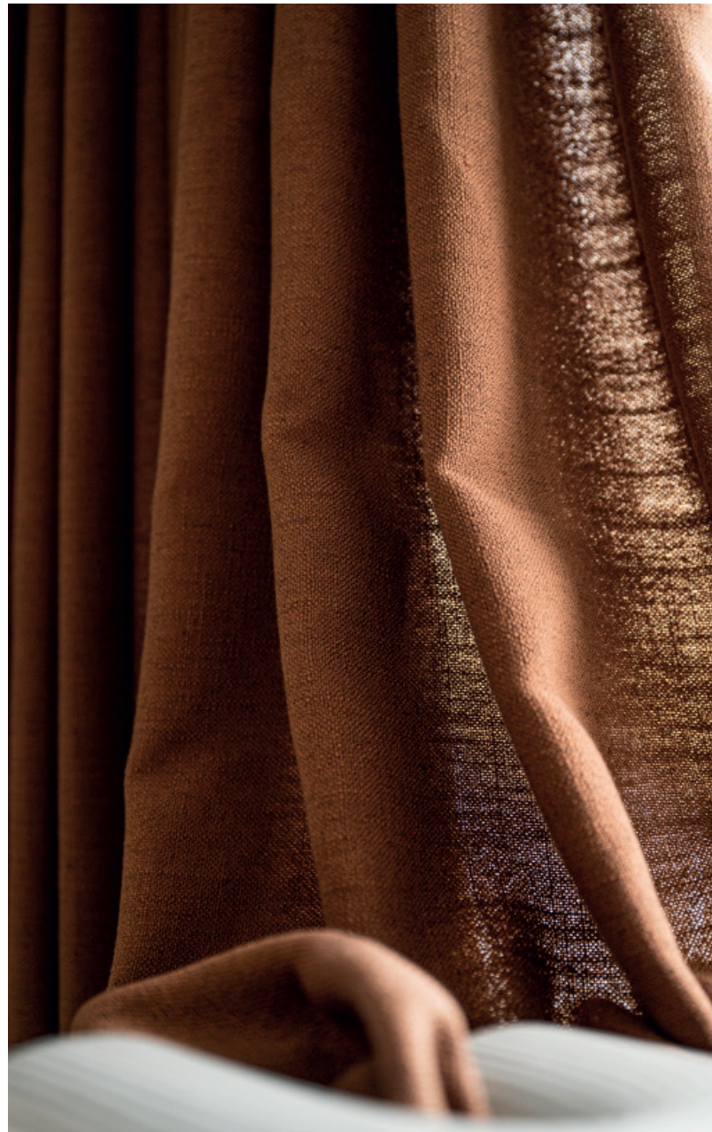
DUMAS colour M13

Our beloved bestseller, Dumas, has been relaunched with a fresh look and even more possibilities. The colour palette has been expanded! The familiar, bestselling colours remain, but have been enhanced with timeless shades and trendy accents that perfectly complement both classic and modern interiors.