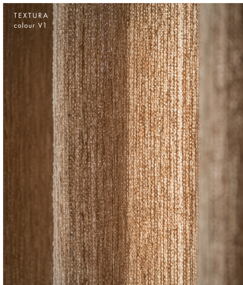
TEXTURA colour V1