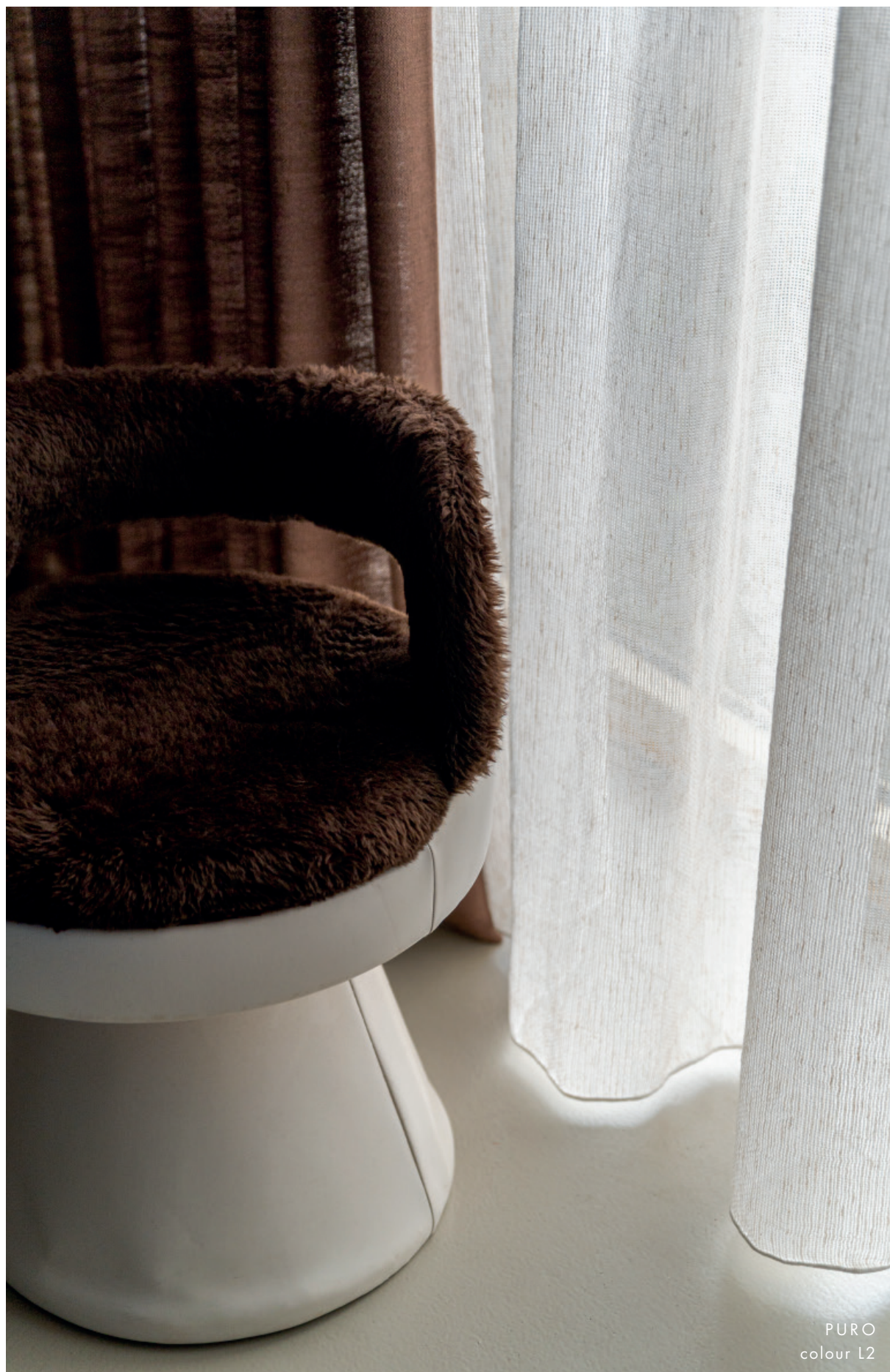
PURO colour L2